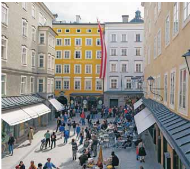
Mozart's Birthplace, Salzburg