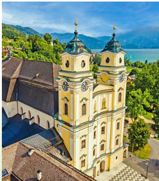
Historic Basilica of St. Michael, the iconic wedding site from "The Sound of Music" in Mondsee