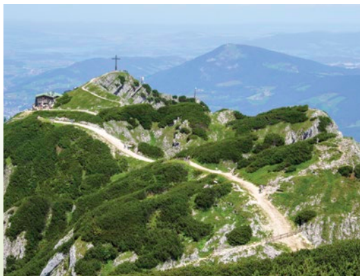
Eagle's Nest, Mount Kehlstein

Hohensalzburg Fortress. Visit the largest fully preserved castle in Central Europe, perched high above the rooftops, to admire panoramic views of the city from Hohensalzburg Fortress.