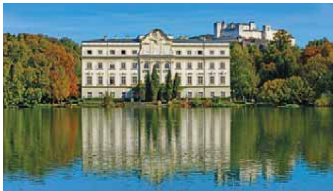
Leopoldskron Palace, one of the filming locations of "The Sound of Music"