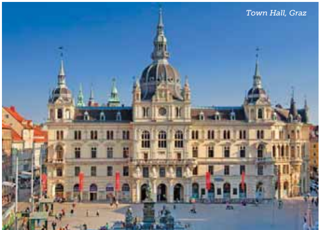
Town Hall, Graz