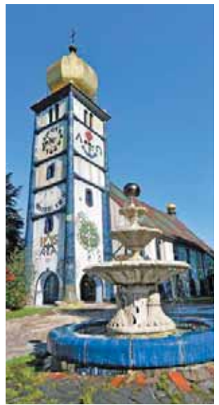
St. Barbara Church, Bärnbach