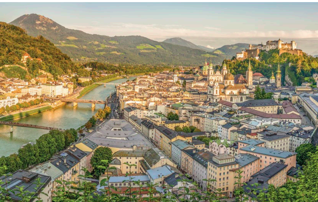
Hohensalzburg Fortress perched above the city of Salzburg