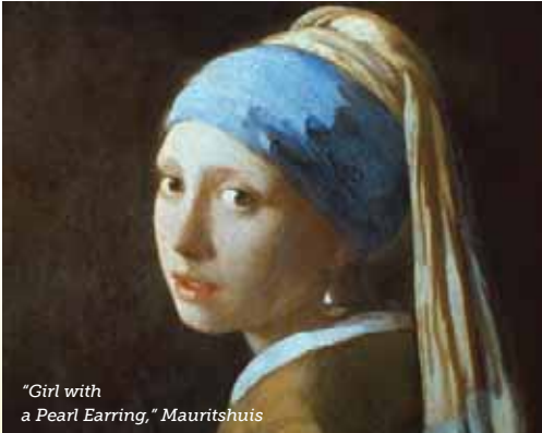
"Girl with a Pearl Earring," Mauritshuis