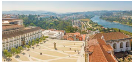
University of Coimbra