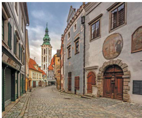
Left: Mineral spring, Karlovy Vary | Above: Český Krumlov