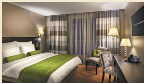
Cosmopolitan Hotel Prague | Prague