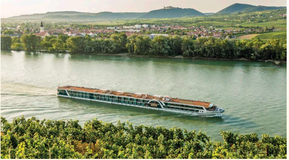
MS Amadeus Queen