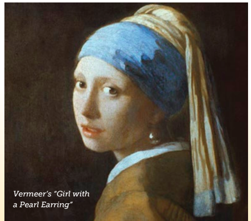
Vermeer’s “Girl with a Pearl Earring”