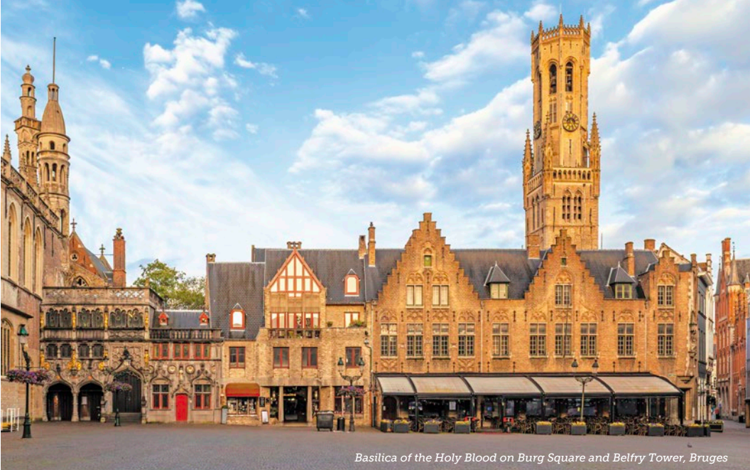
Basilica of the Holy Blood on Burg Square and Belfry Tower, Bruges

including the Binnenhof, the center of Dutch politics, and the Peace Palace, on a scenic tour. Next, view the remarkable paintings and sculptures of the Mauritshuis, which houses Vermeer's "Girl with a Pearl Earring."