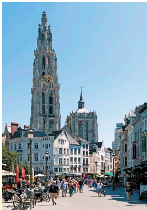
Cathedral of Our Lady, Antwerp