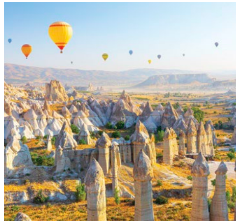
Love Valley, Cappadocia

Etrim. Enjoy a walk in this peaceful Anatolian mountain village and learn about enduring traditions like carpet and kilim weaving.