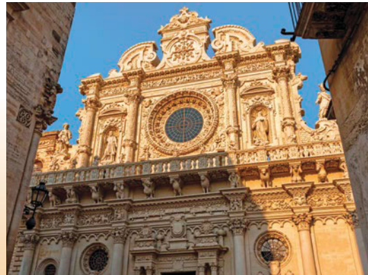
Basilica di Santa Croce, Lecce

Enrichment: History & Architecture of Lecce & Ostuni. Learn about this region's fascinating history and unique architectural styles.