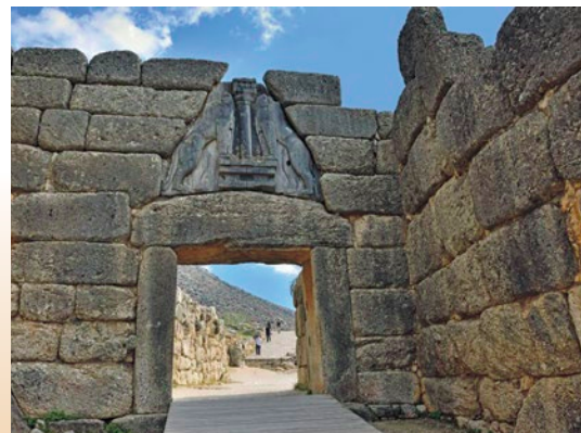
Lion's Gate, Mycenae

Messene. This afternoon, take a guided tour of an under-the-radar gem, the splendid, vast ruins of Messene set in a serene mountain