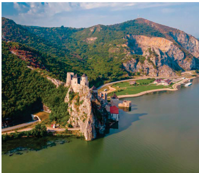
Banks of the Danube River, Serbia