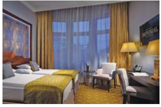
Art Deco Imperial Hotel | Prague, Czech Republic