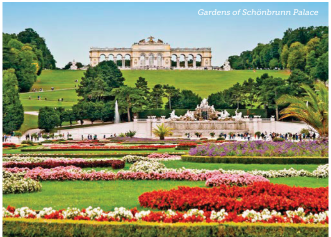
Gardens of Schönbrunn Palace