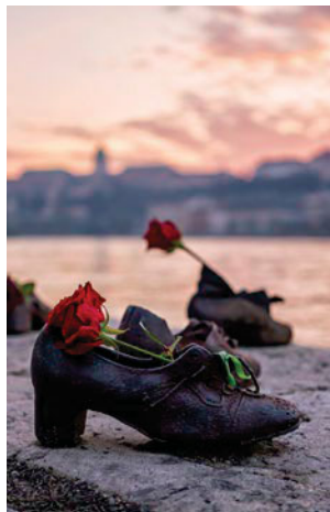
Shoes on the Danube Bank, Budapest