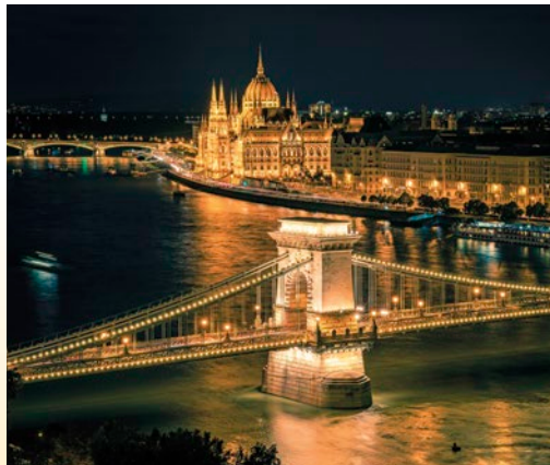
Budapest at night