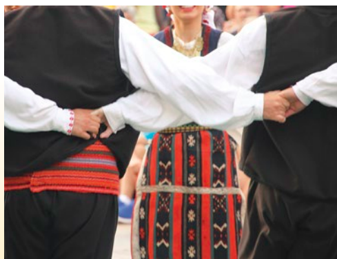
Serbian folk dancing