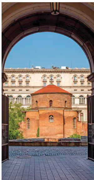
St. George Rotunda, Sofia