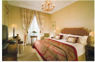
Sofia Hotel Balkan | Sofia, Bulgaria