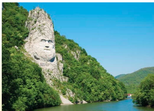
Decebalus stone sculpture, Iron Gate Gorge

Picturesque Passau. See Niedernburg Abbey, the medieval Veste Oberhaus, St. Stephen's Cathedral and other celebrated sites.