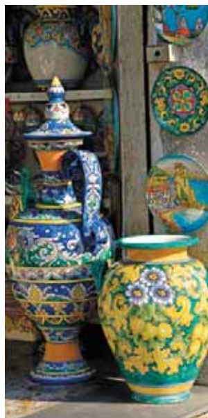
Pottery, Vietri sul Mare

Knowledgeable Lecturers deepen your appreciation for the region and its history, culture and current events.