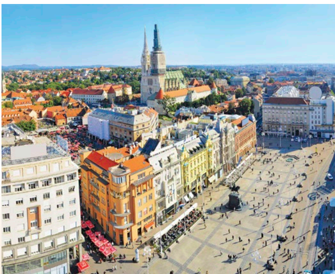
Ban Jelačić Square, Zagreb