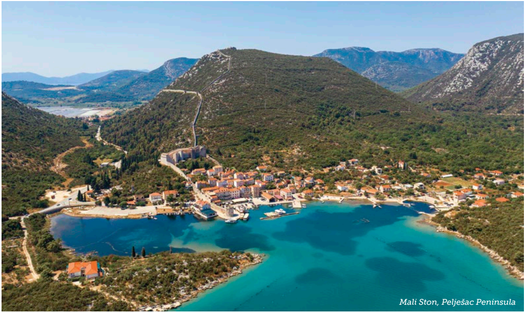
Mali Ston, Peleješac Peninsula