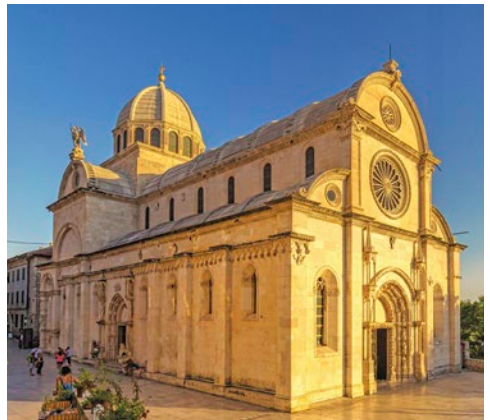
Cathedral of St. James, Šibenik