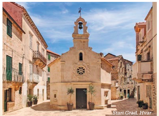
Stari Grad, Hvar

Cultural Šibenik. Uncover the proud city of Šibenik on a guided tour to see its winding alleys, squares and striking buildings. Visit the Cathedral of St. James, one of Europe's most