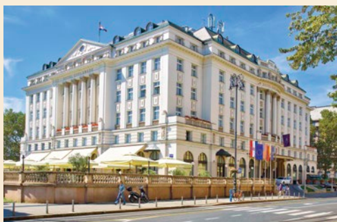
Esplanade Zagreb Hotel | Zagreb