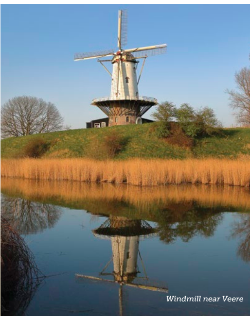
Windmill near Veere