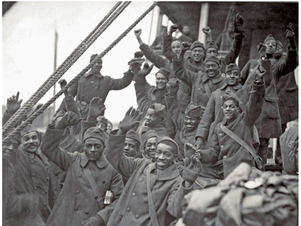
369th Infantry Regiment

An Evening of Jazz. Trace the evolution of French jazz as you stroll through the Latin Quarter and Saint-Germain-des-Prés, where African American musicians played post-WWII. Learn about musical legends, followed by dinner and a concert at a local jazz club.