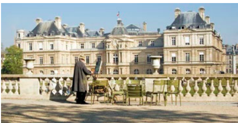
Top: Champs-Élysées | Above: Gardens in Latin Quarter