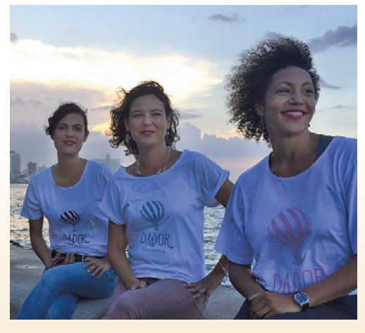
Founders and owners of Dador

Then, visit the historic Hotel Nacional for a tour of the property followed by dinner at a paladar .