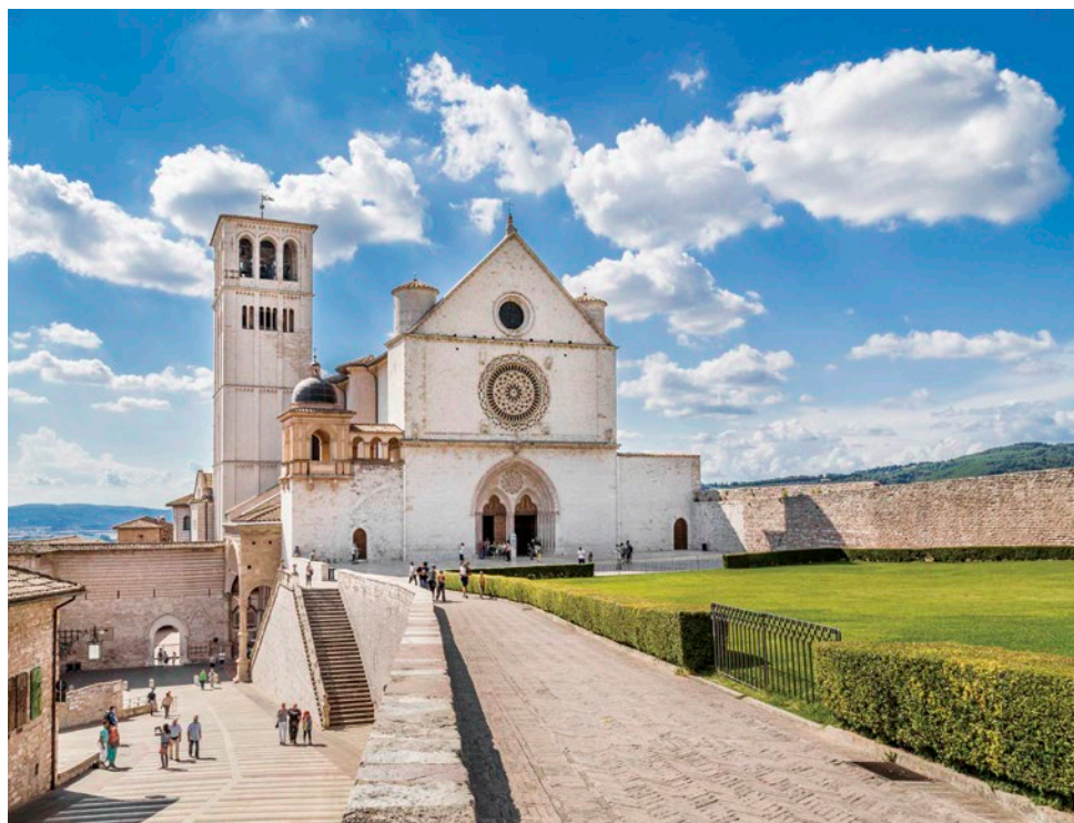
Basilica of San Francesco d'Assisi

Medieval Gubbio. Take a guided tour of this picturesque city at the foot of Mount Ingino. Stroll the elevated Piazza Grande in the heart of Gubbio to the 14th-century Palazzo dei Consoli, famous works of the medieval architect, Giovanni da Gubbio. The historic Corsa dei Ceri festival takes place here as men race on foot, while carrying large, heavy, wooden ceros . See the Cathedral of St. Mariano and St. Giacomo, a religious site built over a Romanesque church, and the "Fountain of the Mad," to hear about its interesting folklore.