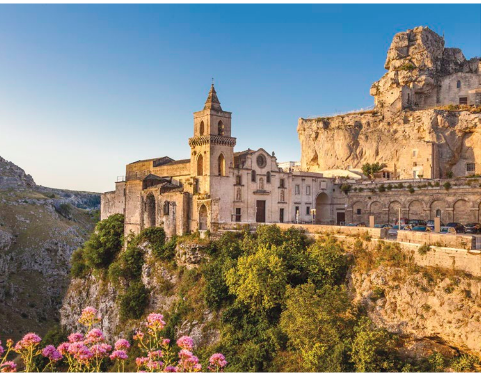
Sassi di Matera

Trani. Explore the historic seaport of Trani. Known for its Moscato di Trani wine and savory figs, this fishing town is home to a 13th-century fort and a cathedral nestled in the harbor of the Adriatic. Take note of the distinguishing Norman houses, a typically English-Romanesque style of architecture.