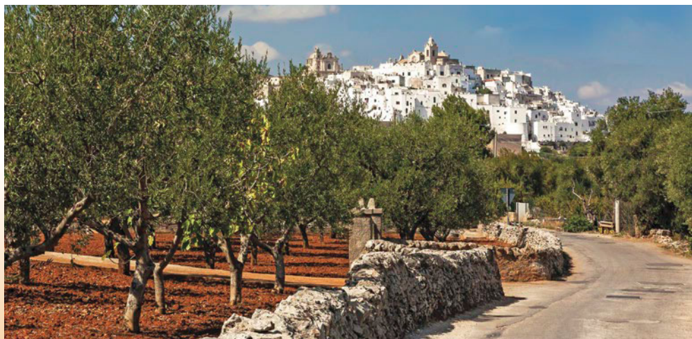
Ostuni, "The White City"

Visit a family-run olive mill in the sun-baked countryside. Learn about the history and cultivation process of olives. Unwind over lunch and gather with the mill's employees or owners to discuss life in Italy.