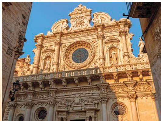
Basilica di Santa Croce, Lecce

Enrichment: History & Architecture of Lecce & Ostuni. Learn about this region's fascinating history and unique architectural styles.