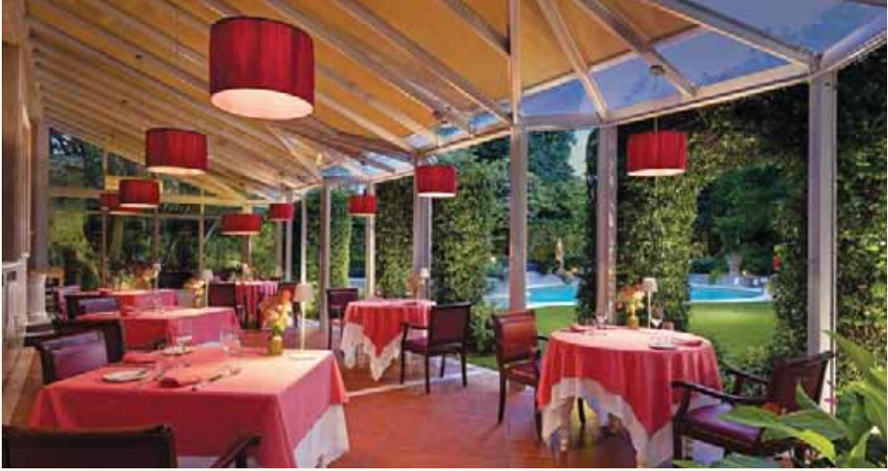
Sina Villa Medici | Florence

CA Seller of Travel Reg. No. 2028271-20. FL Seller of Travel Reg. No. ST-33300. IA Seller of Travel Reg. No. 520. OH Seller of Travel Reg. No. 8889139. WA Seller of Travel Reg. No. 601-820-781. PARTICIPATING AIRLINES-all IATA and ARC Member Carriers ©2025 AHI Travel Printed in the USA