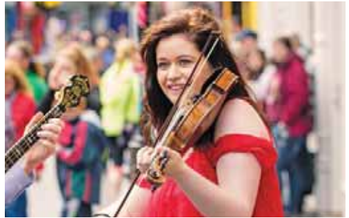
Top: Kylemore Abbey | Above: Musician

Aran Island of Inishmore. Ferry across Galway Bay to the largest of the Aran Islands. As you travel on a minibus, your local guide will share entertaining stories about life on this stark, arresting island, where Gaelic is the first language. See cliffside Dun Aengus, the most famous of the Aran Islands' Bronze Age forts, and pause for lunch before your return ferry.