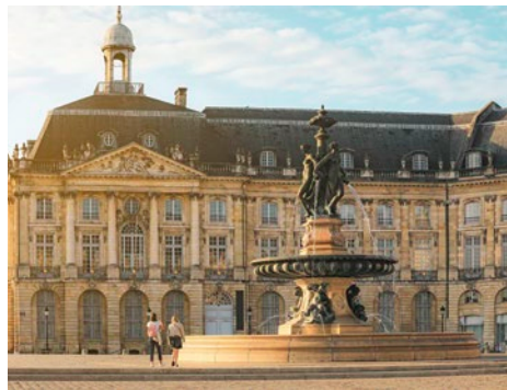
Miroir d'Eau, Place de la Bourse

Laguardia. Soak up the wonderful ambience of the capital of Spain's Rioja Alavesa wine region on a guided walk. See the medieval fortifications, the Romanesque church, the Plaza Mayor and the underground tunnels.