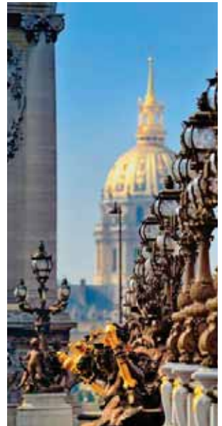
Pont Alexandre III

Knowledgeable Lecturers deepen your appreciation for the region and its history, culture and current events.