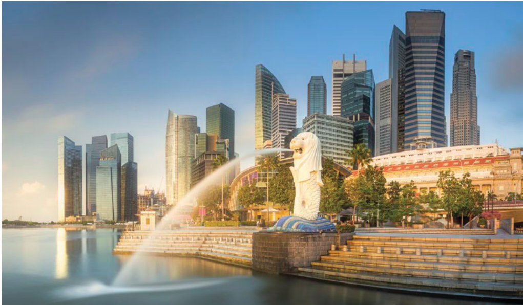
Merlion Park, Singapore

Depart gateway city for Singapore. 🌐 Cross the international date line.