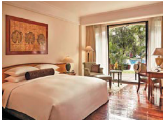
Sofitel Angkor Phokeethra Golf & Spa Resort | Siem Reap, Cambodia