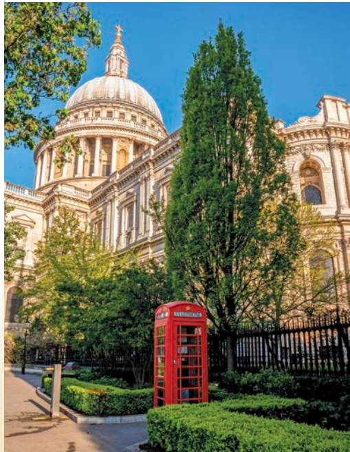
St Paul’s Cathedral