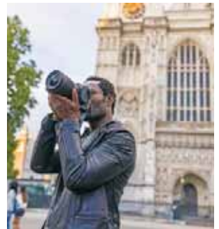
Photo op on walking tour

Knowledgeable Lecturers deepen your appreciation for the region and its history, culture and current events.