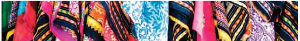
Vibrant traditional fabrics, Brixton market