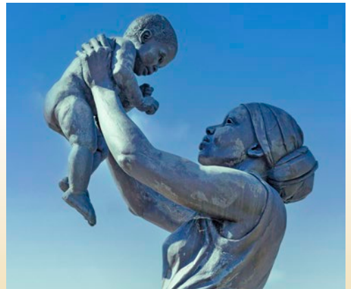
Right: The Bronze Woman, England's first public statue of a Black woman

Commissioned by King George IV, Trafalgar Square has been the center of public life in London since the 13th century. It is packed with galleries, statues, monuments and historic buildings, including the National Gallery, and the famous square has encountered a host of celebrations, political demonstrations and community gatherings. Despite the popularity of Trafalgar Square, few people know that it also holds a rich, often overlooked history.