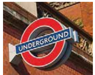
London Underground (transit system)