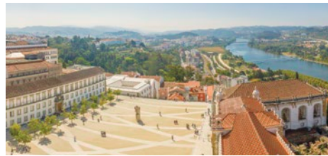
University of Coimbra