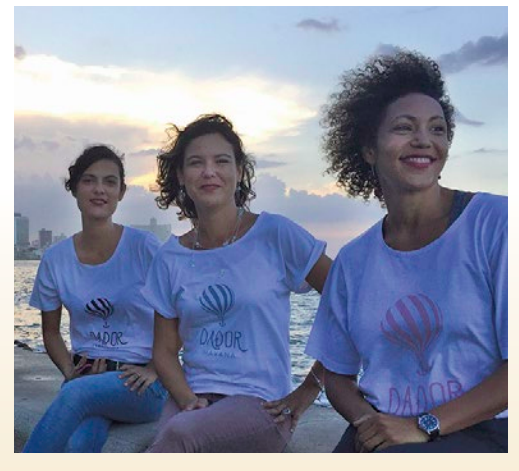
Founders and owners of Dador

Later today, visit the Ludwig Foundation, a nonprofit cultural institution that is dedicated to protecting and promoting Cuban artists. Meet independent local artists and learn about their desires to pursue artistic ventures. Then, visit the historic Hotel Nacional for a tour of the property followed by dinner at a paladar .