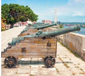
Cannons at fortification, Havana