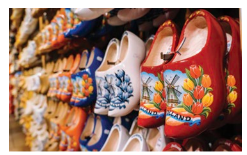
Top: Amsterdam | Above: Traditional wooden shoes