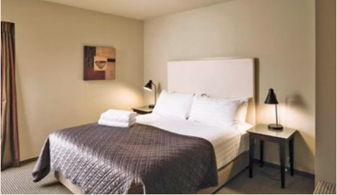
Carnmore Chateau Marlborough | Blenheim ●●●●●