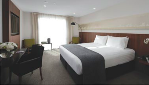
Rydges Latimer Christchurch | Christchurch ●●●●●