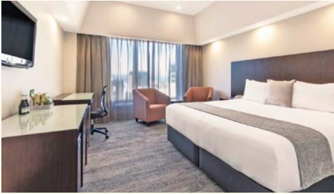
James Cook Hotel Grand Chancellor | Wellington ●●●●●