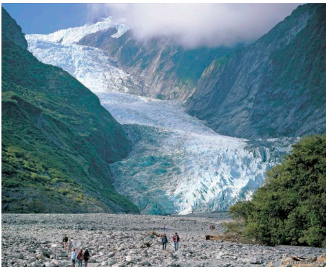
Franz Josef Glacier