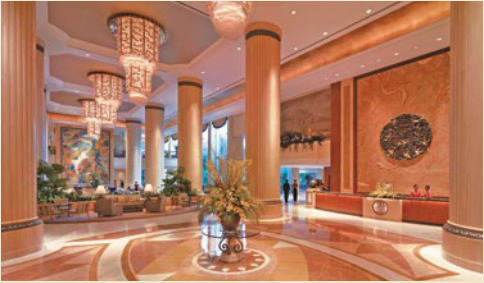
Shangri-La Singapore | Singapore