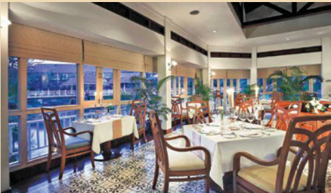
Sofitel Angkor Phokeethra Golf and Spa Resort | Siem Reap