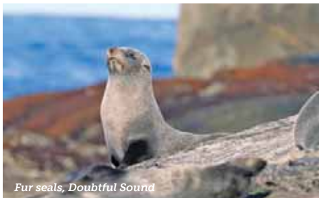
Fur seals, Doubtful Sound

This publication is available in alternative media on request. Penn State is an equal opportunity, affirmative action employer, and is committed to providing employment opportunities to all qualified applicants without regard to race, color, religion, age, sex, sexual orientation, gender identity, national origin, disability or protected veteran status. UBR ALU 25-15