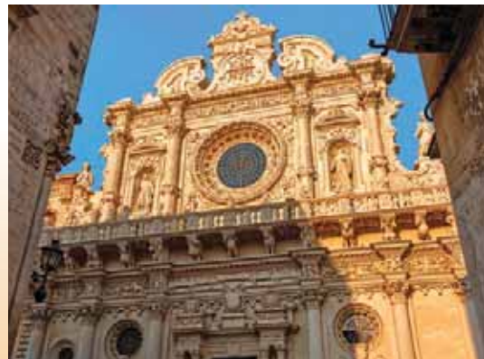
Basilica di Santa Croce, Lecce

Enrichment: History & Architecture of Lecce & Ostuni. Learn about this region's fascinating history and unique architectural styles.