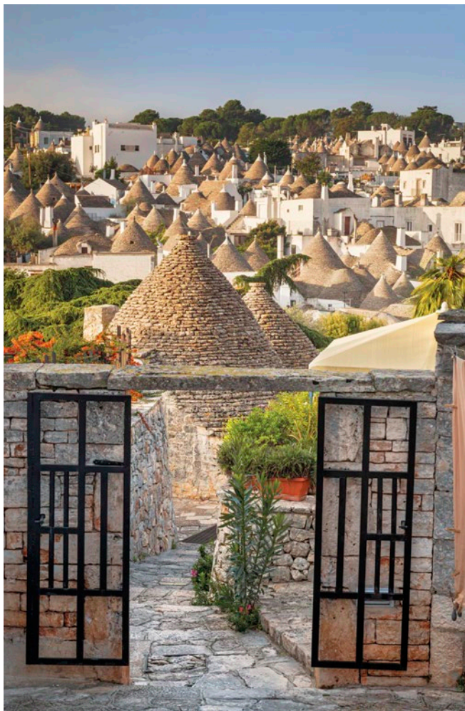
Trulli of Alberobello