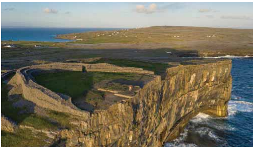
Dun Aengus, Inishmore