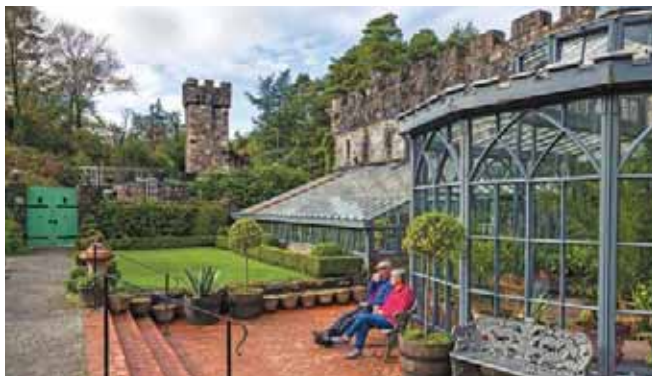
Glenveagh Castle, Glenveagh National Park