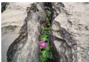
Flora among the limestone, Burren