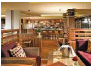
Westport Plaza Hotel | Westport