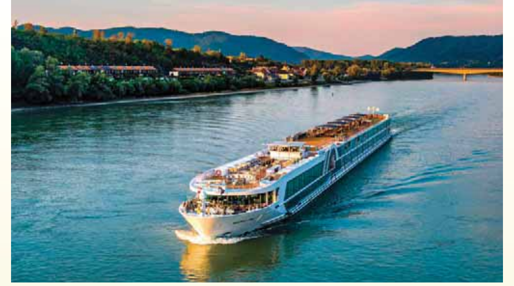
MS Amadeus Cara