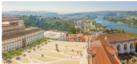
University of Coimbra