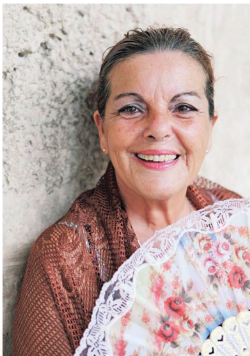
Top: Cathedral, Havana