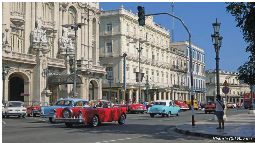
Historic Old Havana