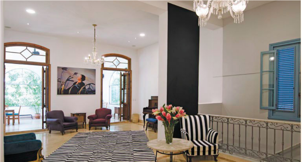
ARTeHOTEL | Havana