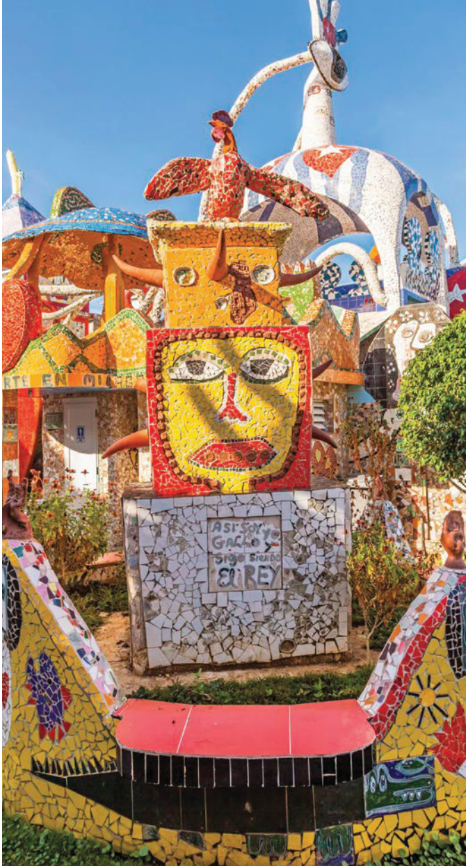
Above: Casa Fuster, the studio of Cuban artist and sculptor José Fuster Below: Agromercado, a sustainable local market