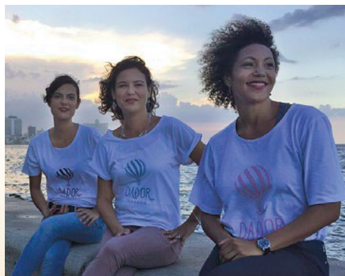
Founders and owners of Dador

Jewish Culture & Cuban Dance. Visit the Ashkenazi Community Center to learn about Cuba's Jewish culture. Then, stop at Malpaso, a contemporary dance studio to meet and