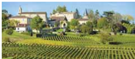
Jurisdiction of Saint-Émilion

OSU Alumni Association Travel Program Mission To promote fellowship, education and enjoyment for Oregon State University alumni, their families and friends by providing attractive travel and lifelong learning opportunities.