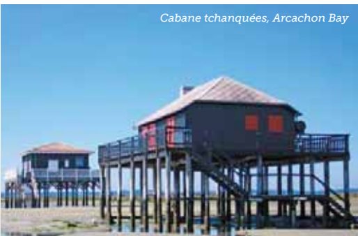
Cabane tchanquées, Arcachon Bay

San Sebastián. Called Donostia in Basque, San Sebastián became known as a resort town when Queen Isabella II chose it as her summer seaside retreat in the mid-1800s. Spanish royalty and aristocrats followed, and the city expanded with grand Belle Époque buildings. See its highlights, including the 18th-century, baroque Basílica de Santa María del Coro, on a guided walk through the buzzing old town and along the waterfront promenade by spectacular La Concha Bay.