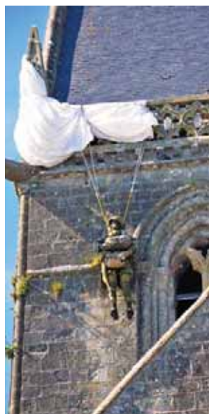
Private John Steele Monument, Sainte-Mère-Église

Knowledgeable Lecturers deepen your appreciation for the region and its history, culture and current events.