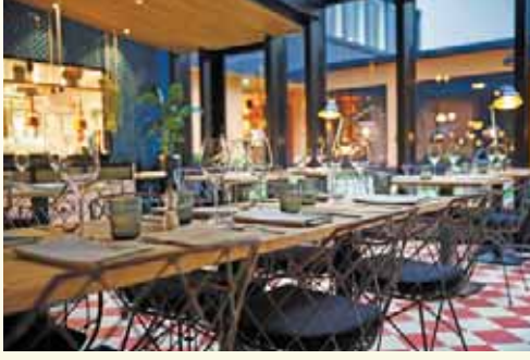
Hotel U14 | Helsinki