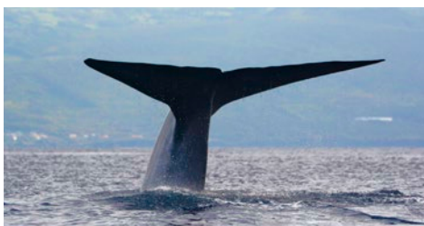
Top: Sete Cidades | Above: Whale watching in the Azores