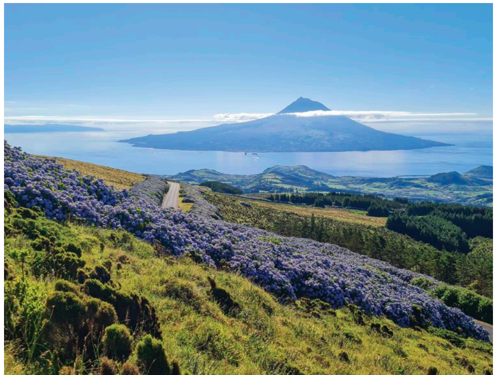
The view of Pico Island from Faial Island