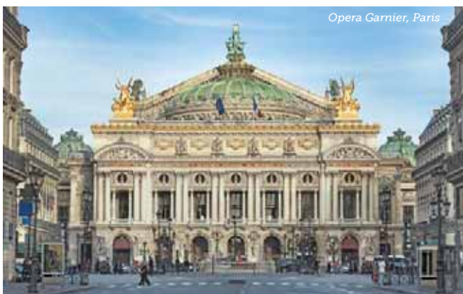
Opera Garnier, Paris