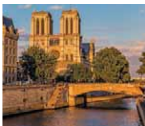
Notre Dame, Paris