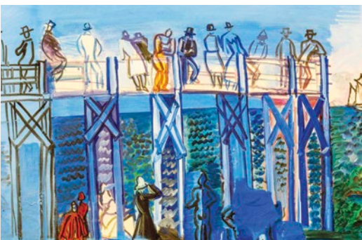
The Pier and the Beach at Le Havre, Raoul Dufy (1926) MuMa, Le Havre

understand why this captivating tidal island is considered a wonder of the Western world. Walk to visit the tranquil abbey that has drawn pilgrims for centuries. Marvel at its Roman and Gothic architecture and contemplate its place as a symbol of faith and resilience. (Active)