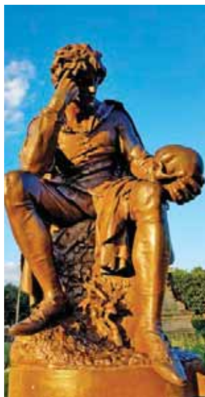
Hamlet Monument, Stratford-upon-Avon

Knowledgeable Lecturers deepen your appreciation for the region and its history, culture and current events.