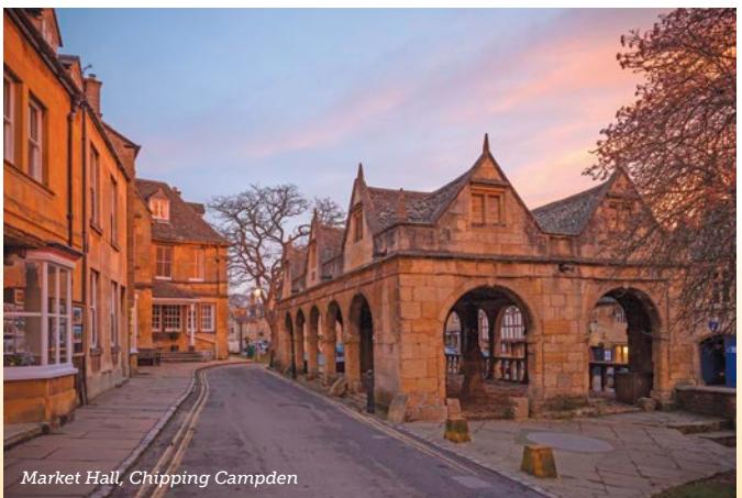
Market Hall, Chipping Campden