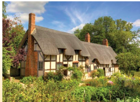
Family home of Anne Hathaway

Cotswolds – A Journey Through an Area of Outstanding Natural Beauty. Delight in breathtaking rural England as you discover endearing Cotswolds villages, each with its own unique history and character. Visit Stow-on-the-Wold, designed with narrow lanes that allowed for easy shepherding during the wool trade era.