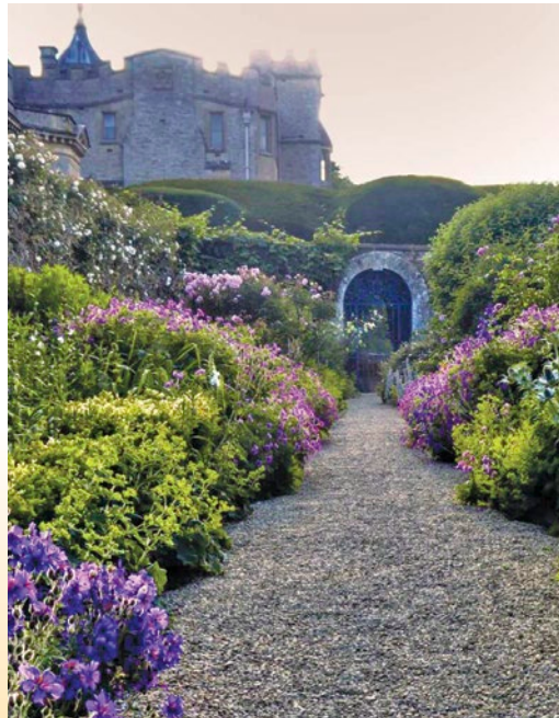
Rousham House and Gardens