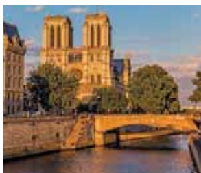
Notre Dame, Paris