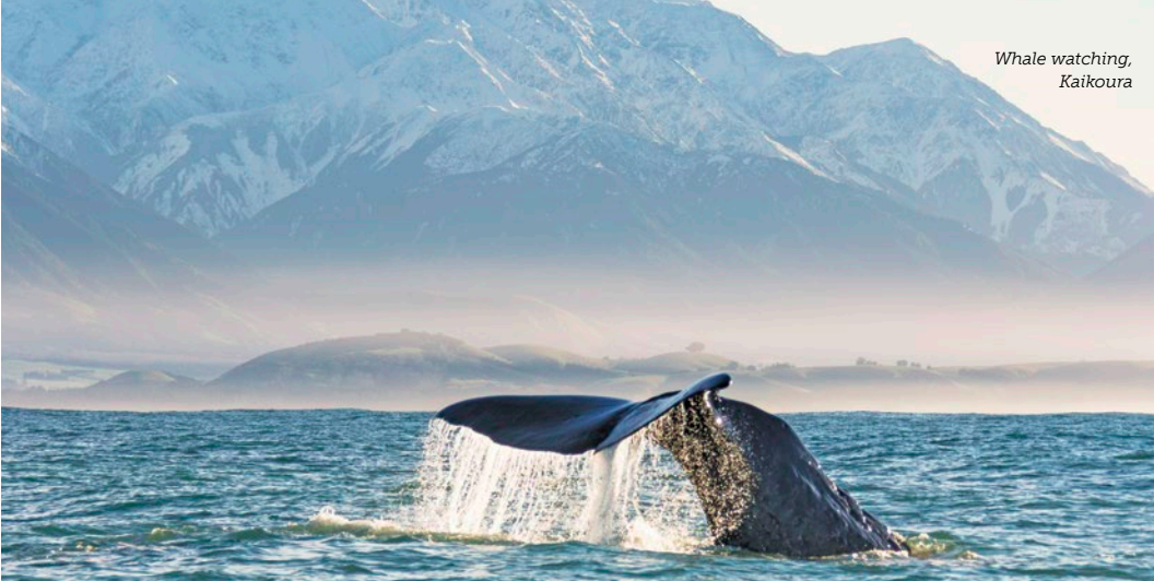
Whale watching, Kaikoura