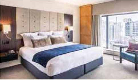
Grand Millennium Auckland | Auckland ●●●●●