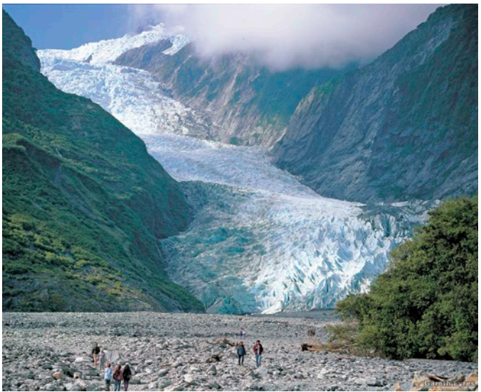
Franz Josef Glacier