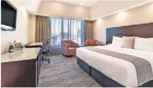
James Cook Hotel Grand Chancellor | Wellington ●●●●●