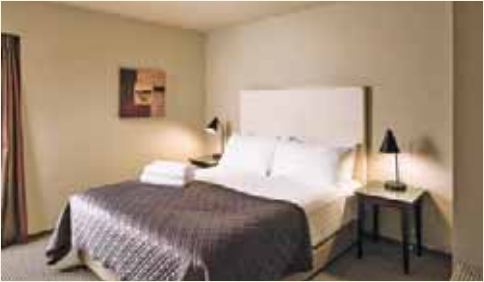
Carnmore Chateau Marlborough | Blenheim ●●●●●