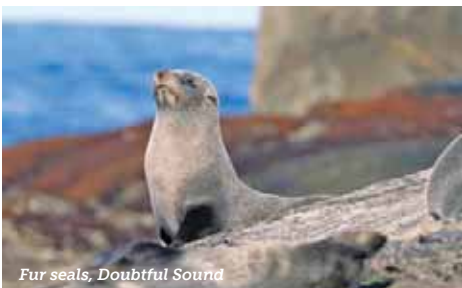
Fur seals, Doubtful Sound