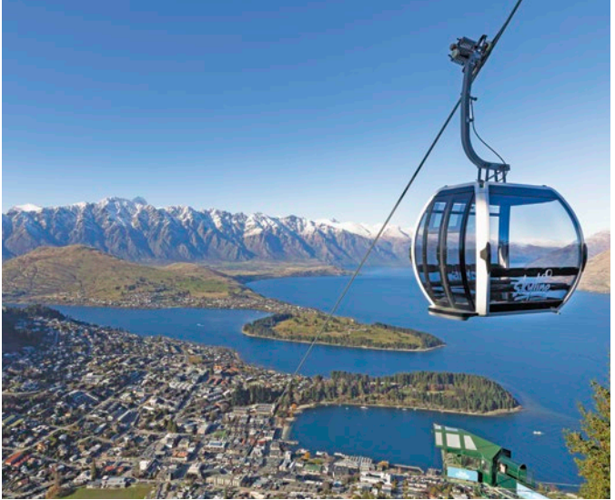
Gondola ride, Queenstown