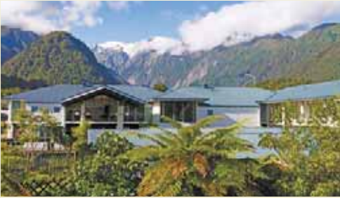
Scenic Hotel Franz Josef Glacier | Franz Josef