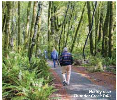
Hiking near Thunder Creek Falls