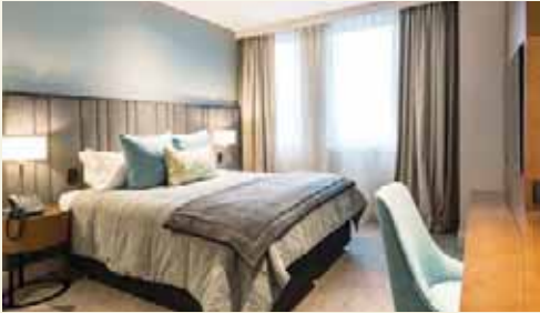
Distinction Christchurch Hotel | Christchurch ●●●●●