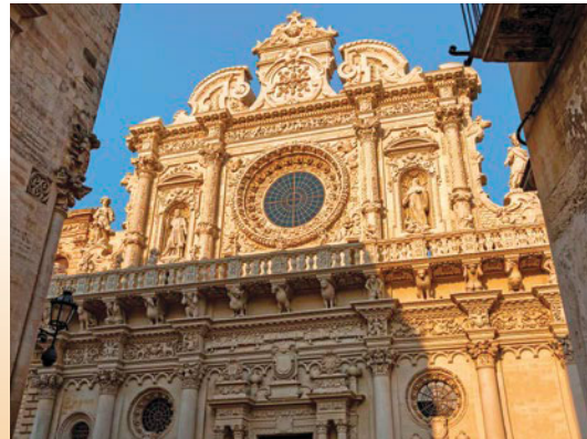
Basilica di Santa Croce, Lecce

Enrichment: History & Architecture of Lecce & Ostuni. Learn about this region's fascinating history and unique architectural styles.