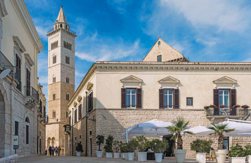
Cathedral bell tower, Trani