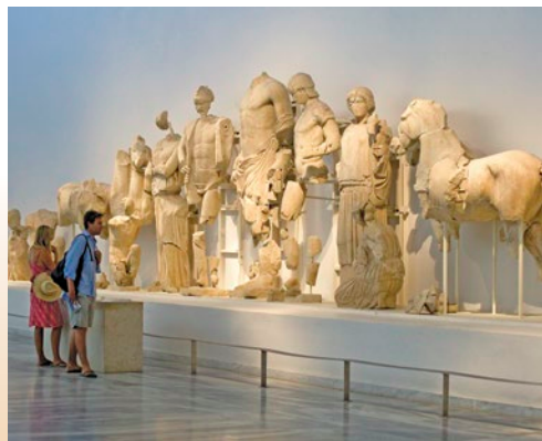
Archaeological Museum, Olympia

Sparta, Mystras & the Greek Olive. Walk with your guide through the ruins of ancient Sparta, one of Greece's most powerful city-states. Travel later to the stunning ruins of Mystras above the Laconian plain. In 1249, a Frankish prince built a castle there, which fell into the hands of the Byzantine Empire 13 years later. Over the next two centuries, Mystras evolved into the most important Byzantine city in the southern Peloponnese. Hear about its significance from your guide and admire the monasteries, chapels and churches adorned with frescoes. Finally, tour Sparta's Museum of the Olive and Greek Olive Oil, which details why the olive is prized by the Greeks. (Active)