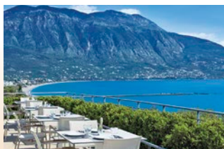
Pharae Palace Hotel | Kalamata