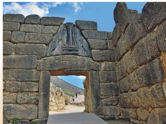
Lion's Gate, Mycenae

Messene. This afternoon, take a guided tour of an under-the-radar gem, the splendid, vast ruins of Messene set in a serene mountain