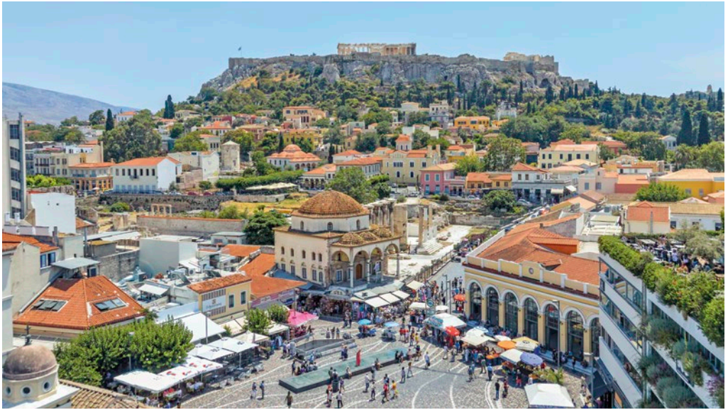
The Acropolis overlooking Athens