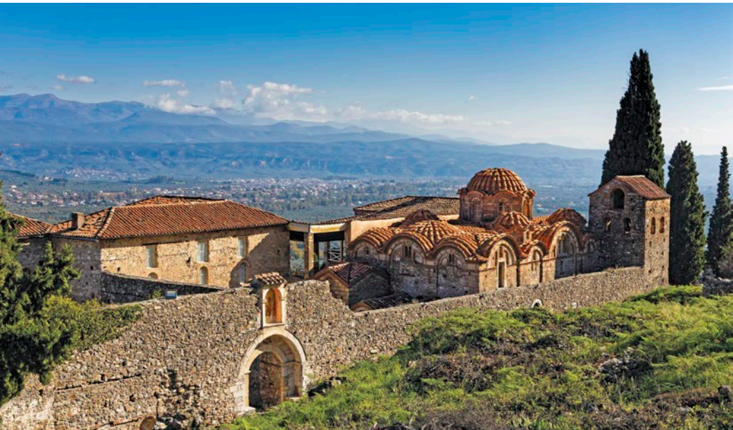
Byzantine architecture, Mystras

valley. Unlike other sites, this ancient city built around 369 B.C. was largely untouched by subsequent settlements, so its remains are remarkably intact. See its grand temples, agora, theater, stadium and more. (Active)