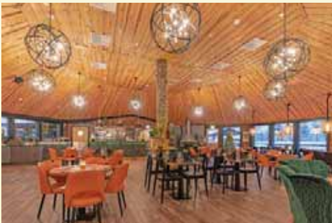
Northern Lights Village | Saariselkä