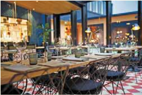
Hotel U14 | Helsinki