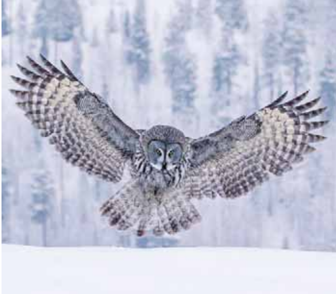
Great Grey Owl, Lapland