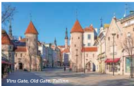
Viru Gate, Old Gate, Tallinn

Historic Center (Old Town) of Tallinn, Estonia