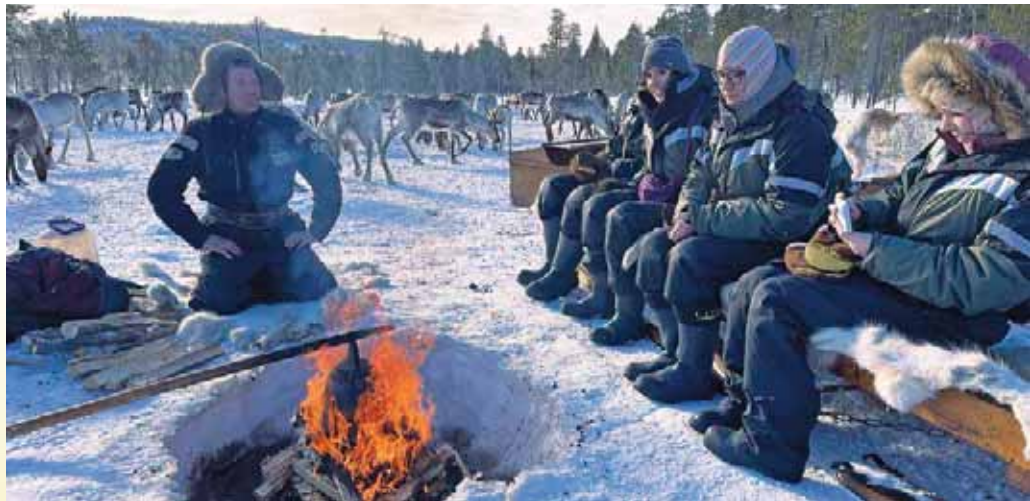
Reindeer farm visit

AHI Connects | Finnish Reindeer Farm. Reindeer husbandry has been an intrinsic part of Sámi culture since the Middle Ages.