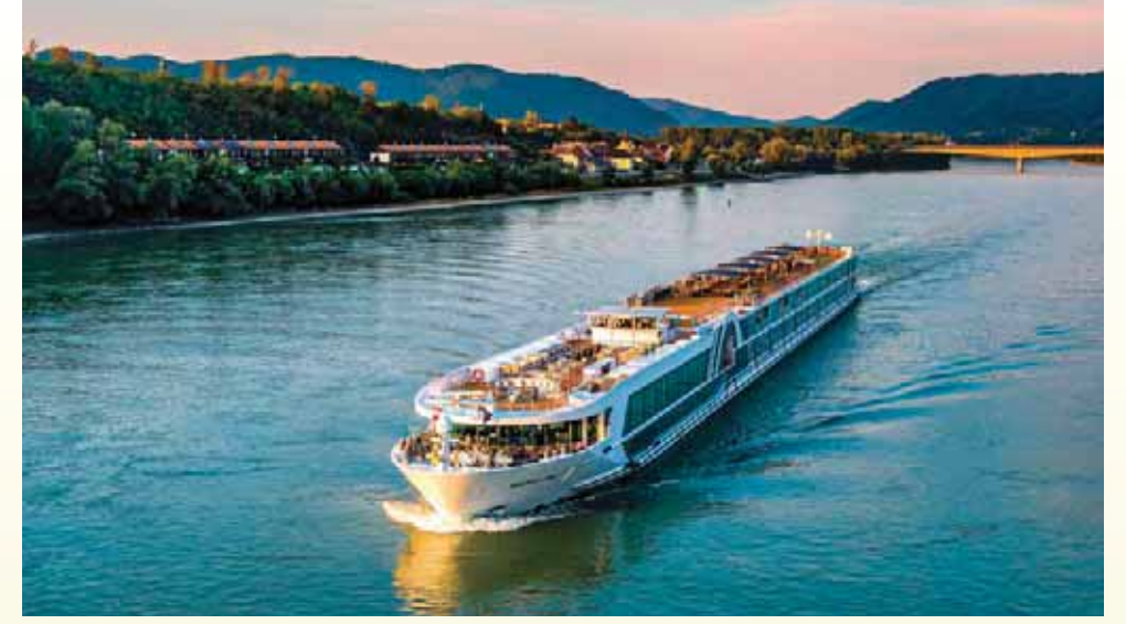
MS Amadeus Cara