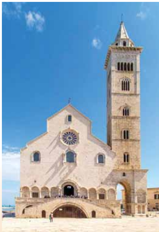
Cathedral of St. Nicholas, Trani