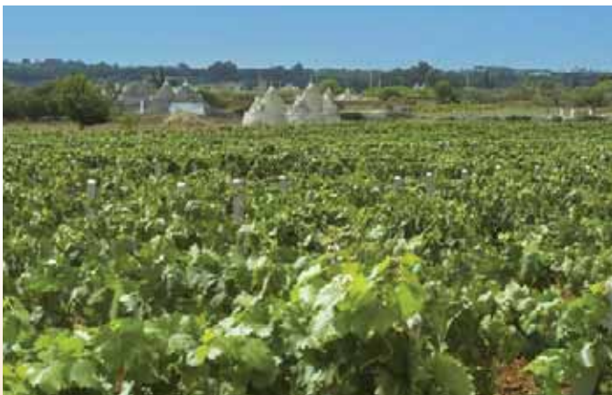
Vineyards and trulli in the countryside near Alberobello