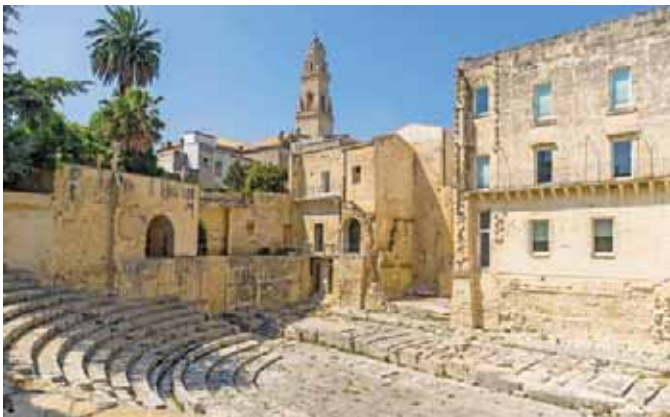
Ruins of a Roman amphitheater, Lecce