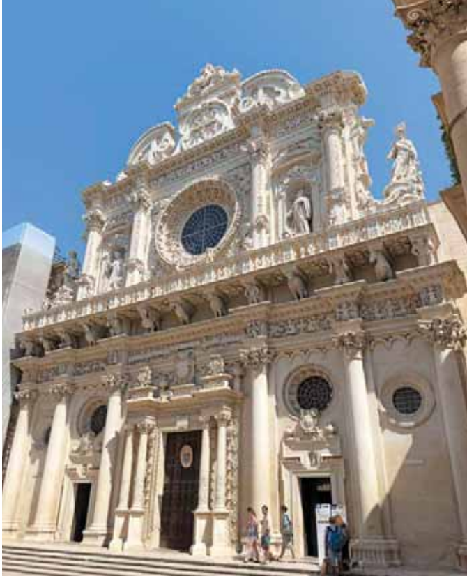
The magnificent baroque architecture of the Basilica of Santa Croce, Lecce