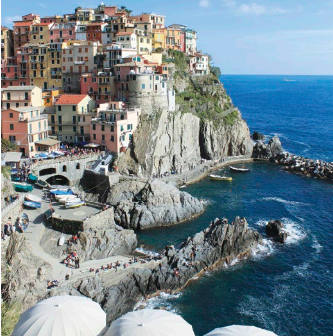
Manarola, Cinque Terre