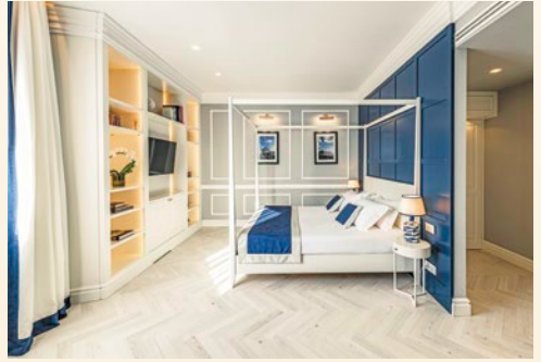
Hotel Vis à Vis | Sestri Levante