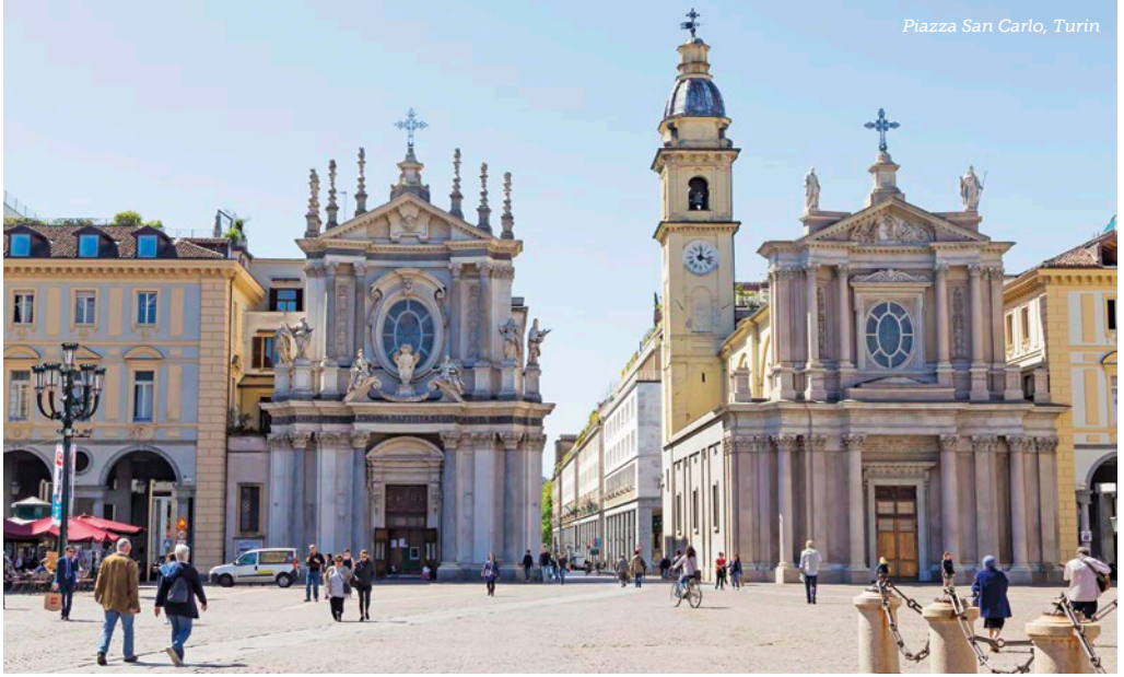
Piazza San Carlo, Turin