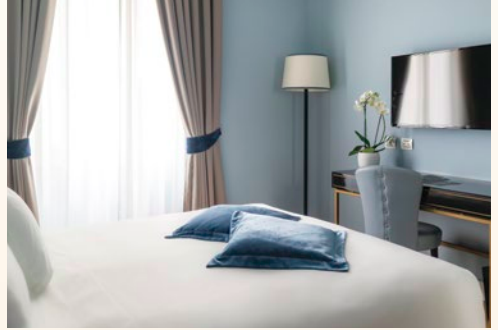
Turin Palace Hotel | Turin