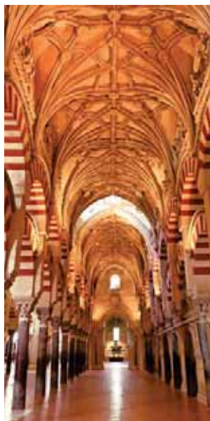
La Mezquita, Córdoba

Knowledgeable Lecturers deepen your appreciation for the region and its history, culture and current events.